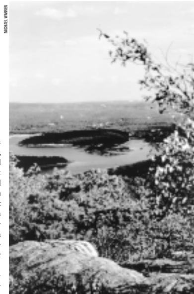
The Wyanokies, in the heart of the New Jersey Highlands, typifies the natural features which contributed to the trail's national designation as NJ's Millennium Trail.

"The New York-New Jersey Trail Conference is thrilled to have the Highlands Trail recognized by the White House Millennium