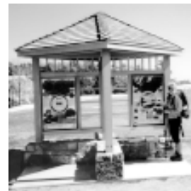
Rita Heckler refers to the new, three-sided kiosk in Minnewaska State Park Preserve. Known as the Wildmere kiosk, it is located near the picnic area by the upper parking lot of the park's main entrance.

On the Appalachian Trail, near the Trailside Museum and Nature Center, a double-paneled kiosk depicts a historic and inspirational trilogy from the park's annals: the building of the very first section of the AT right in the park by Trail Conference volunteers; the genesis and growth of the NY-NJ Trail Conference as the leadership organization for hikers' interests;